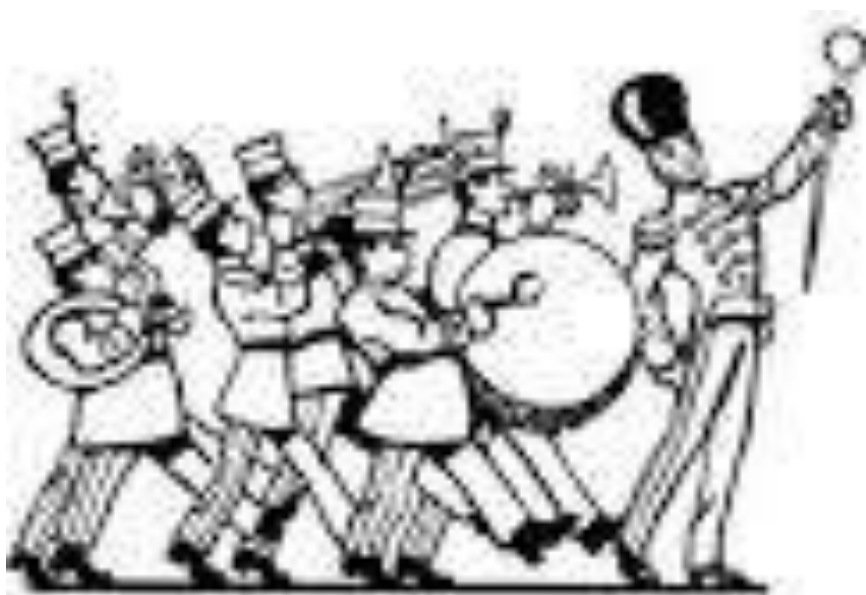
ST Marching Band @ State Fair Aug. 29th