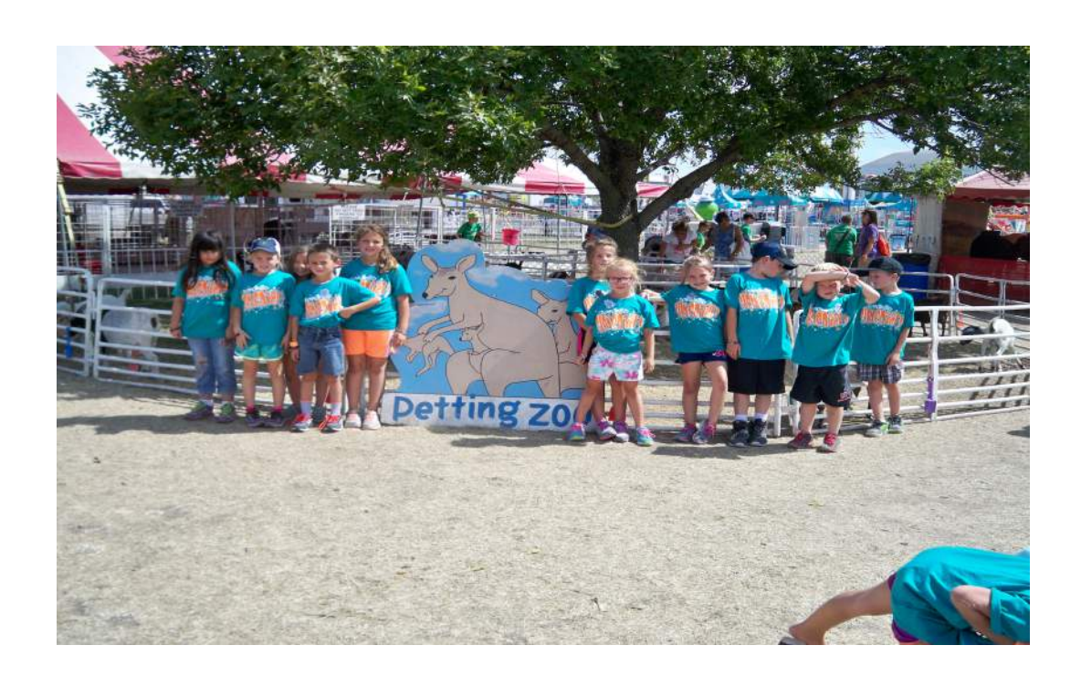
We also enjoyed walking through the livestock barns.