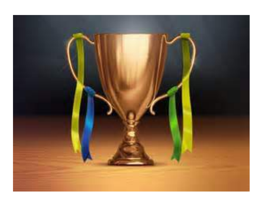
Old Trophies and Awards!!

Sandhills Patrons: Please stop by the lecture hall during the homecoming game on Friday October 9th. Help yourself to any of the old trophies or plaques if you would like to have a piece of Sandhills history as a keepsake. After October 9th, the old trophies / awards will be recycled. Thank you!